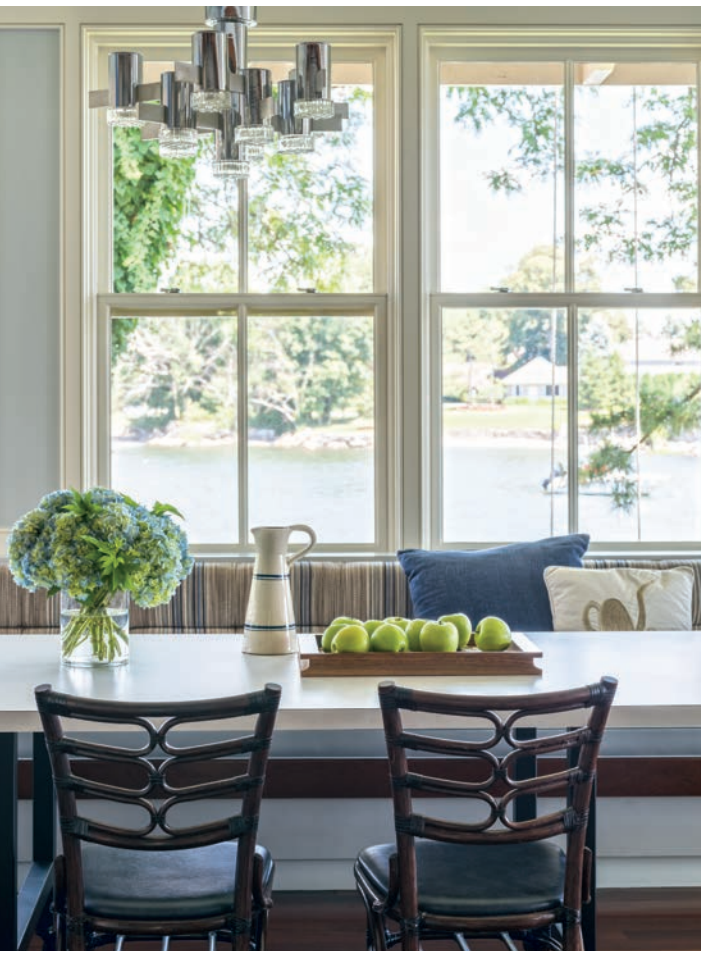
left: A Gaetano Sciolari steel-and-glass light fixture presides over the kitchen table. below: Hans J. Wegner bar stools offer additional seating at the island. The kitchen features both natural limestone and hardwood flooring. opposite: The custom-designed lampshades are by The Accessory Store in Stamford.