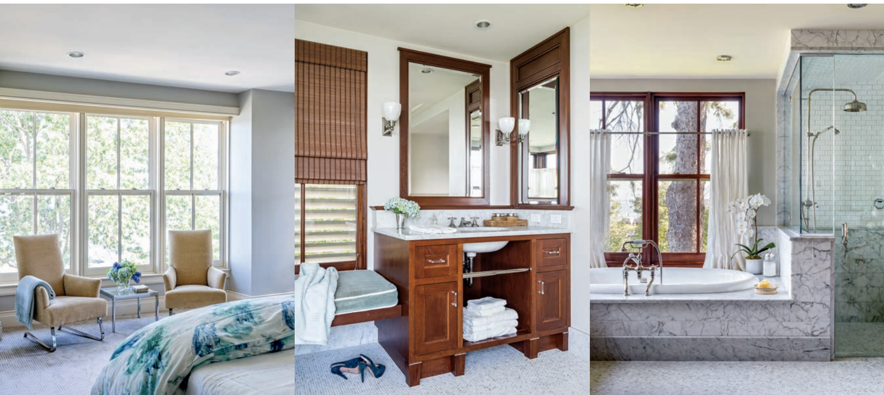
above left: Donghia vintage chairs were a clean-lined addition to the master bedroom. above right: Window treatments in the master bath were fashioned from Dedar's Gri-Gri fabric in Avorio. opposite: Sferra's Tavia duvet and pillows, Grande Hotel standard pillows and Terina decorative pillows add subtle touches of green to the serene space.

was moved away, and it was absolutely the smartest decision we ever made. The kitchen is now closer to the living room, and we now use the living room a lot more than we ever did. We also use our dining room more because of those two tables.