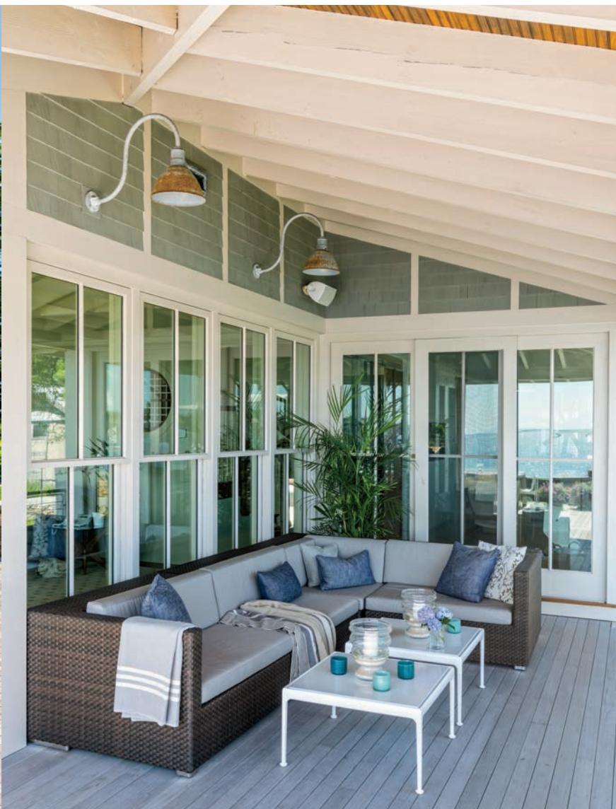
above left: Outdoor dining is always on the menu with a Restoration Hardware Belvedere dining table and plenty of seating by Richard Schultz for Knoll. above right: Outfitted with a Dedon sofa and Richard Schultz for Knoll tables, the covered porch off the family room and kitchen is primed for enjoying a cup of coffee or reading a book.